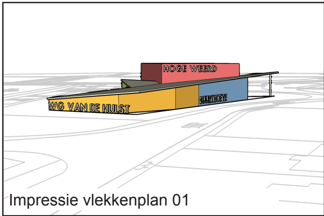
Impressie vlekkenplan 01