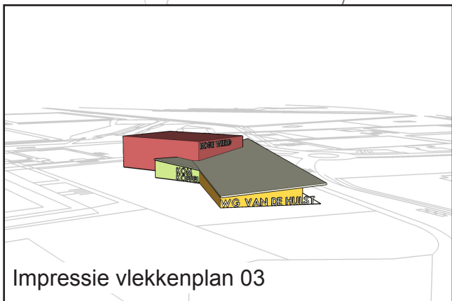
Impressie vlekkenplan 03